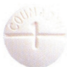
Light tan 1mg